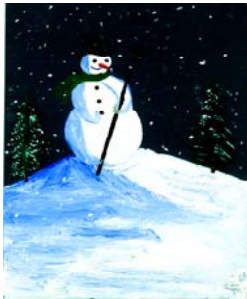
SNOWMAN SIZE 115MM X 150MM (4" X 6") PACK A £2.50 FOR 6