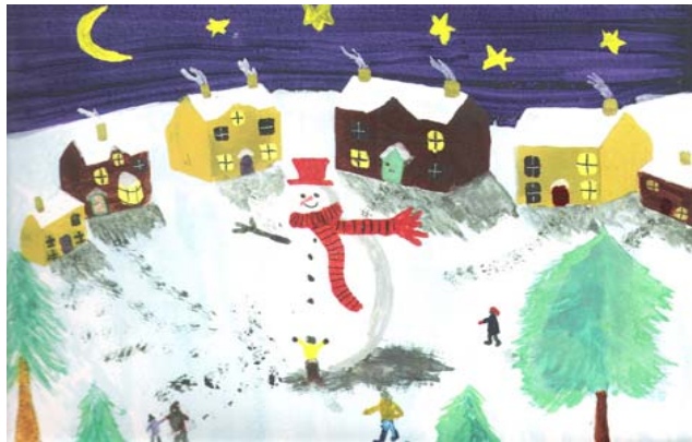
SNOWMAN & HOUSES" SIZE 210MM X 150MM (8" X 6") PACK D - £3.00 FOR 6