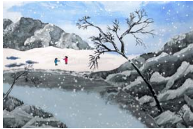
WINTER SCENE SIZE 150MM X 115MM (6" X 4") PACK B - £2.50 FOR 6