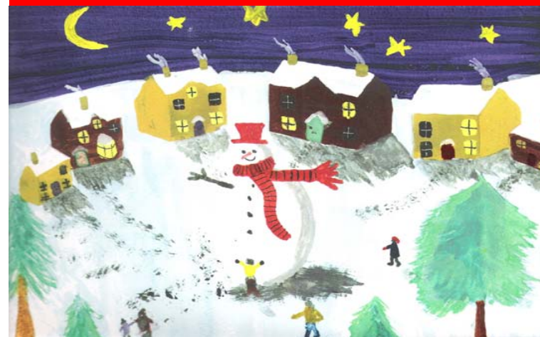
SNOWMAN AND HOUSES - SIZE 210MM X 150MM (8" X 6") BY DAVE MILLAR

HEADWAY BRISTOL CHRISTMAS CAROL SERVICE FRENCHAY PARISH CHURCH, SUNDAY 13TH DECEMBER 09 6.00 - 7.00 PM AND AFTERWARDS AT CENTRE