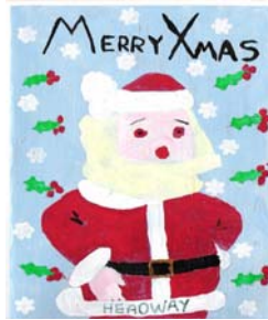
SANTA SIZE 115MM X 150MM (4" X 6") CLEARANCE PACK C - £1.50 FOR 6